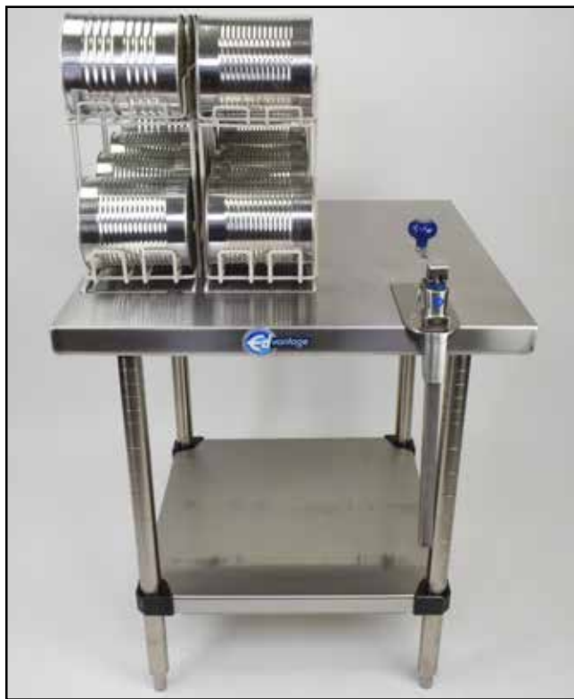
Model EDCS-2F shown with fixed Legs and SG-2 NSF light duty Can Opener