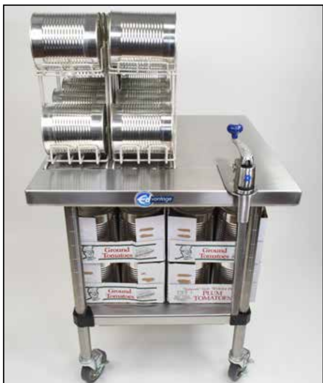
Model EDCS-11M shown with Locking Casters and S-11 NSF Can Opener

Now, Edlund introduces an innovation breakthrough with our new Edvantage® Can Opening and Storage Station complete with built-in Stainless-Steel NSF can opener. For the first time, operators have immediate access to 16 self-feeding #10 cans from dispensers built on top of the table, right next to the opener, eliminating the stress of having to bend over to reach for every can. Plus, the heavy-duty, all stainless table can hold an additional 36 cans on the 500lb. capacity shelf below. Whether you choose the fixed leg version or the mobile version with locking casters, this is the ultimate solution to most operators' can opening requirements. Every other can rack storage station is simply at a DIS-EDvantage!